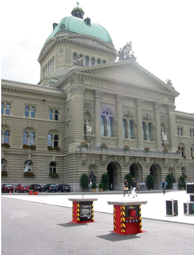
simple and quick – Power wherever needed!